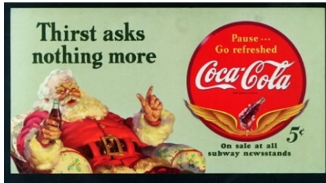
Exhibit 2 Santa Claus Coca-Cola Print Ads, circa 1931