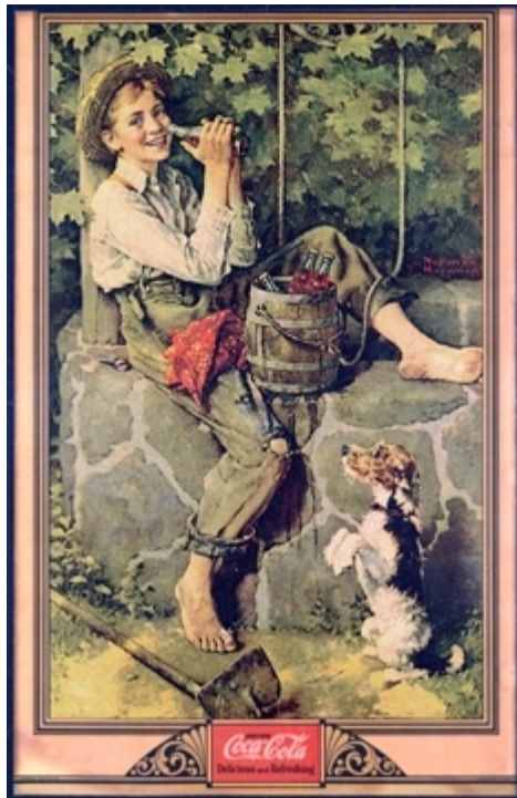
Exhibit 1 Norman Rockwell Coca-Cola Print Ads, circa 1930